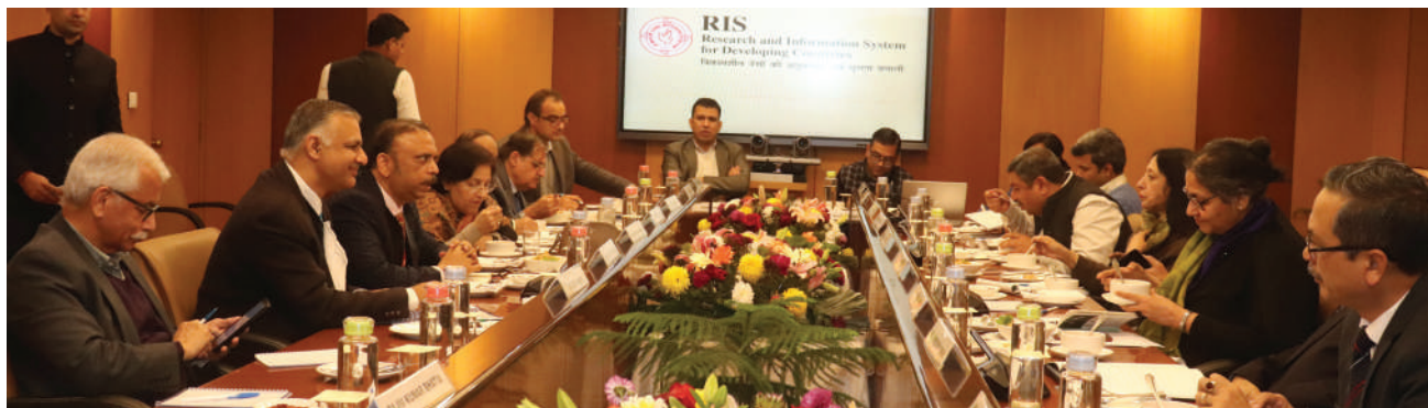
Distinguished participants at the session.