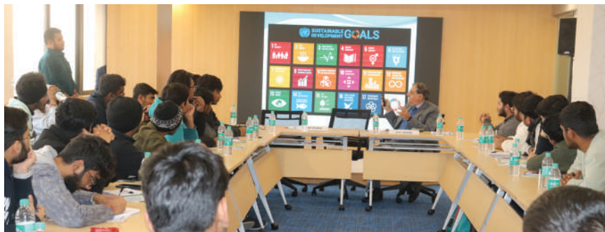
The session in progress.