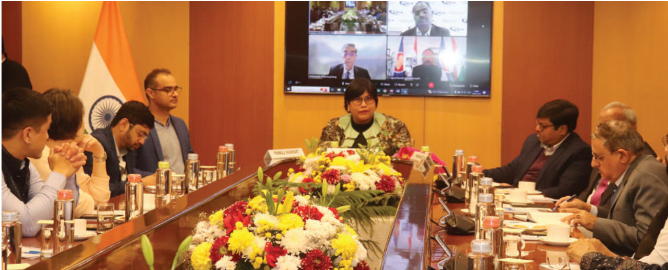
Distinguished speakers at the seminar.

The International Seminar on “20th ASEAN-India Summit: From Outcomes to Implementation” was held on 8 February 2024 at RIS. Delegates, policymakers and subject experts to deliberate on a wide range of crucial topics for ASEAN-India partnership.