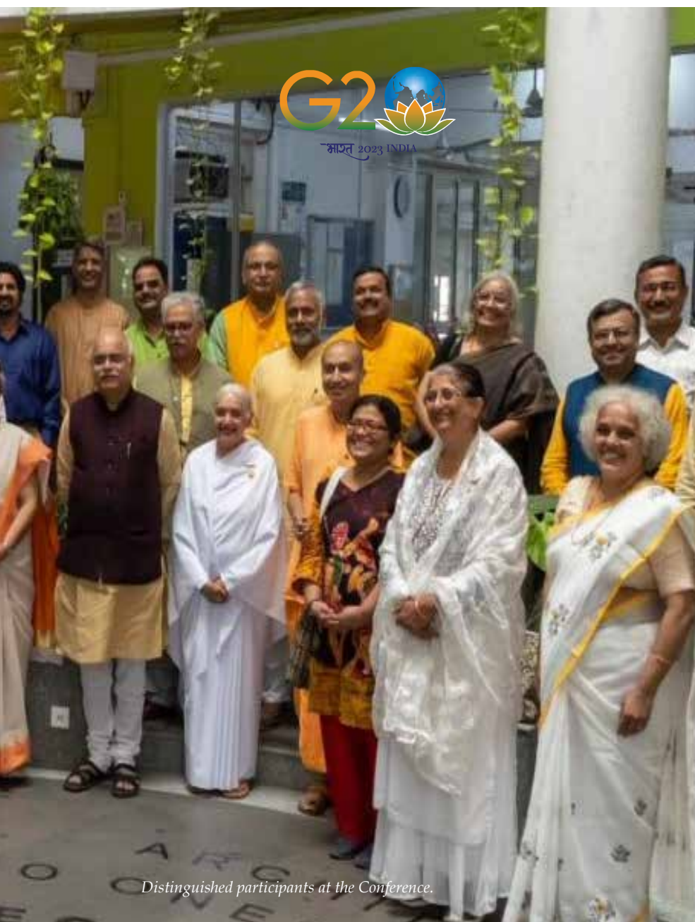
Distinguished participants at the Conference.

Therein, what should be the role of CSOs in developmental paradigm and going beyond continuous deliberations, research and discussions; and institutional arrangements that may be needed for this purpose? Finally, how can Indian CSOs help in devising indigenous solutions for problems in developing world, starting from identifying problems, understanding local experiences and