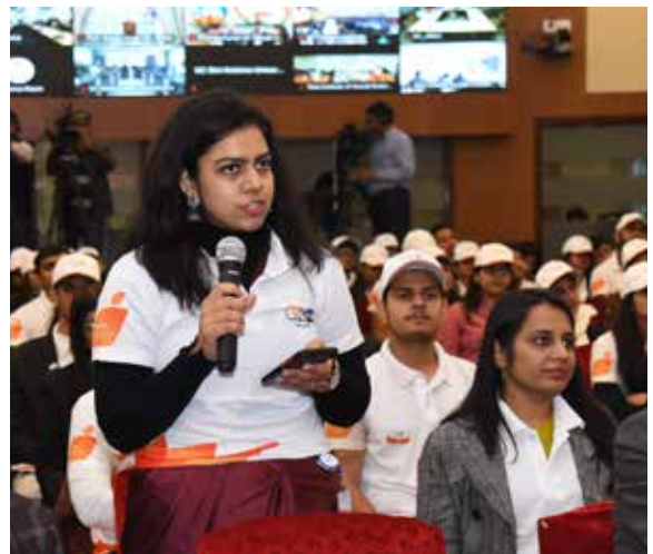
Interactivity session with the students in progress.

External Affairs to spread awareness among the students and the youth