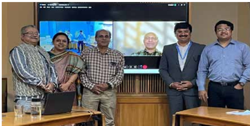
Distinguished participants at the Panel Discussion.