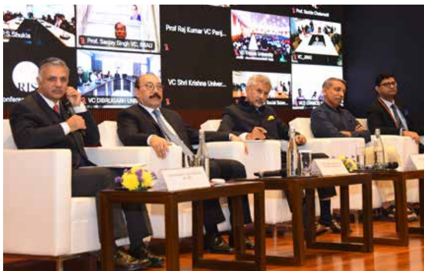
Distinguished participants at a Valedictory Session.

Dr P.K. Mishra, Principal Secretary to the Prime Minister delivered the keynote address. Dr Mishra emphasized that the lecture series could prepare future leaders and help create capacity for providing inputs into multilateral process like G20 in the future besides stressing the critical role of Jan Bhagidari. He also stressed on the emerging opportunities for the countries like India to leverage upon.