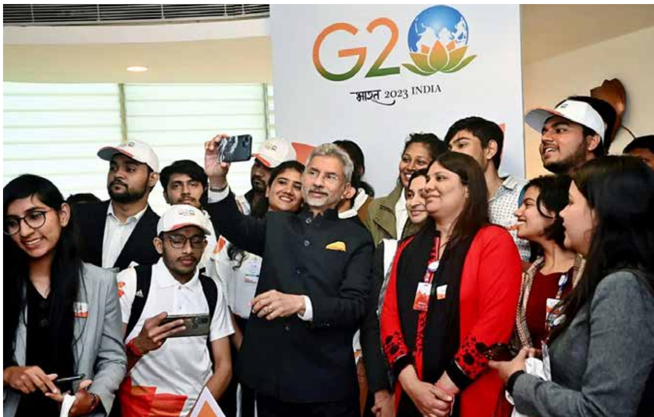
Hon'ble EAM with students.

under the G20 university connect series by organising 75 lectures on G20 issues at 75 universities across different states and union territories of India.