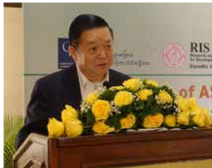
Special Address by H.E. Dr. Kao Kim Hourn, Minister Delegate Attached to the Prime Minister of the Kingdom of Cambodia and Secretary General (Designate), ASEAN

H.E. Dr. Kao Kim Hourn, Minister Delegate Attached to the Prime Minister of the Kingdom of Cambodia and Secretary General (Designate), ASEAN extended a dinner talk. Dr. Kao Kim Hourn reminded us that India-ASEAN strategic partnership was