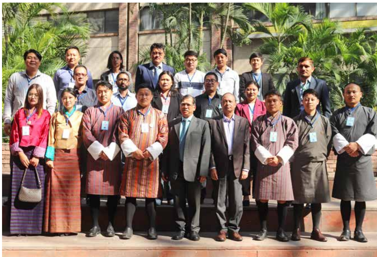
A delegation of Bhutanese Journalists and Editors.