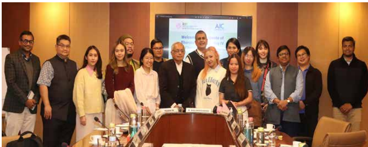
Adelegation from the Chulalongkorn University at RIS.

A delegation of Thai scholars from the Chulalongkorn University visited the RIS on 21 December 2022 under the annual flagship study tour "Bharata Shiksha Yatra". In this visit, they wanted to get enriched on