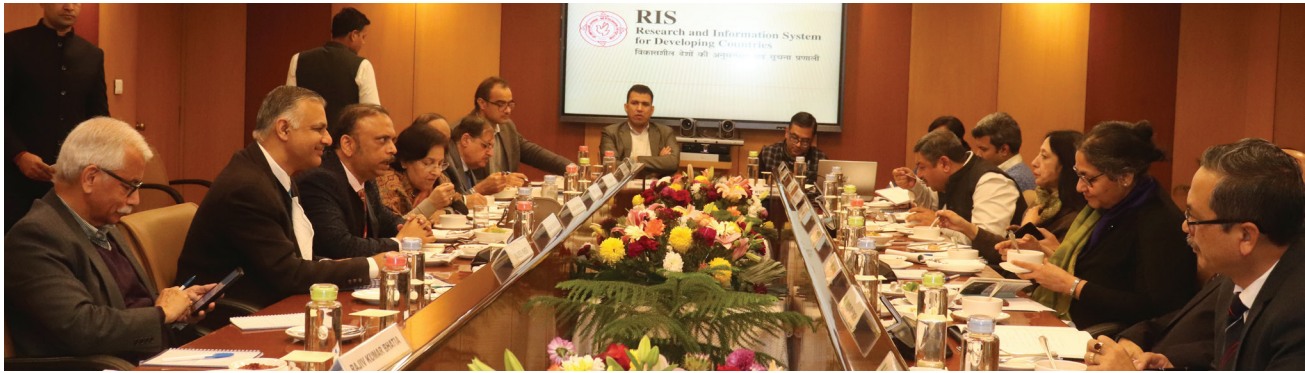
Distinguished participants at the session.