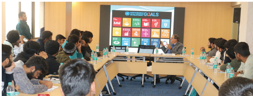
The session in progress.