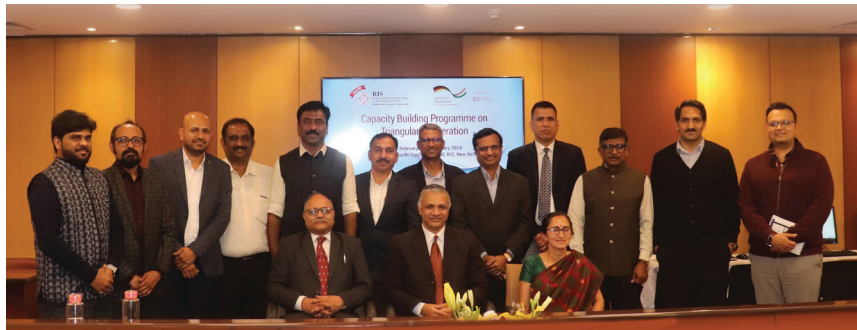
Participants at the Capacity Building Programme.

It was attended by 11 participants from 9 diverse institutions, encompassing academia, development cooperation practitioners, civil society, and other stakeholders. The programme was designed to orient the participants towards an integrated and multi-dimensional understanding of Triangular cooperation and covered