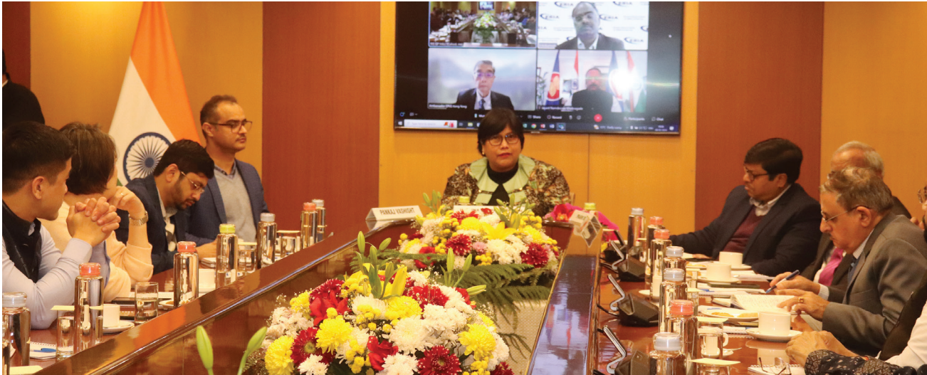
Distinguished speakers at the seminar.

The International Seminar on “20th ASEAN-India Summit: From Outcomes to Implementation” was held on 8 February 2024 at RIS. Delegates, policymakers and subject experts to deliberate on a wide range of crucial topics for ASEAN-India partnership.