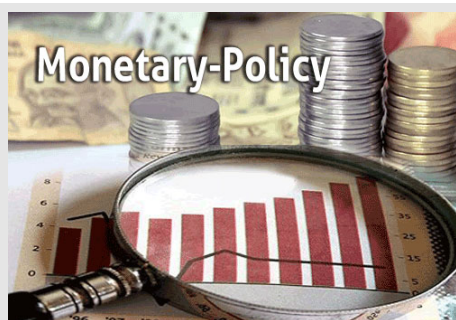
Upcoming June monetary policy likely to see a tightrope balancing act: ex-RBI Dy Guv

New Delhi, May 21 (KNN) The RBI in its upcoming June monetary policy will be faced with a “huge challenge” of doing a tightrope balancing act between growth and inflation, especially in view of Wholesale Price Index (WPI)-based inflation and core WPI inflation inching up as well as due to the need to maintain price stability with an eye on growth, according to former RBI Deputy Governor, Usha Thorat.