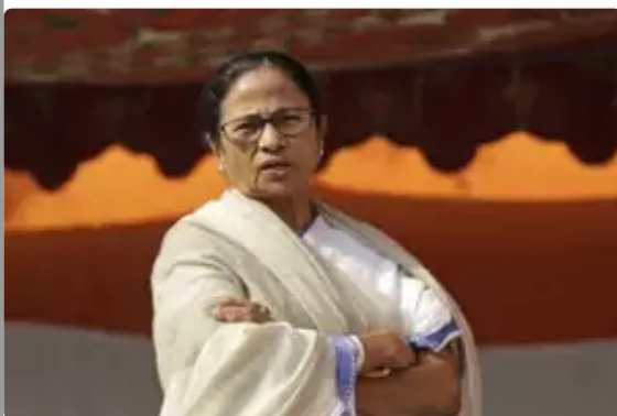
Bengal saved India today: Mamata Banerjee on landslide victory