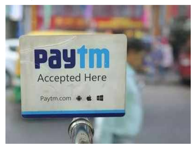
How logjam with China has hit Indian startups

NEW DELHI: Rarely have two words in an obscure document like IPO prospectus raised as many eyebrows as the use of "significant influence" by Ant Group did recently.