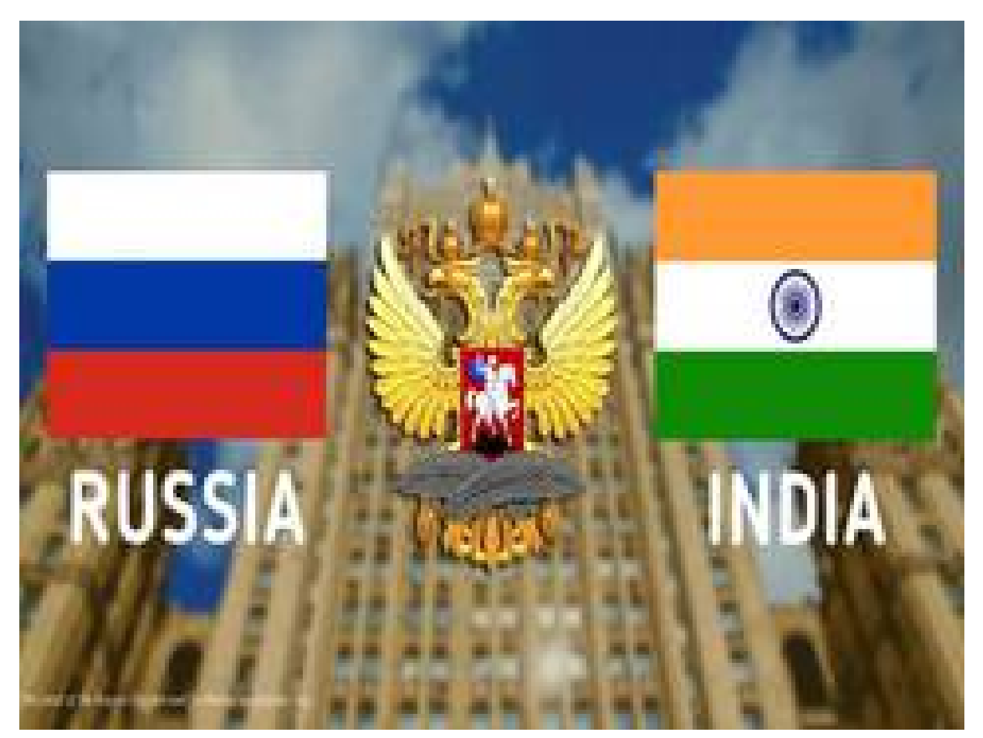
Indian delegation to participate in Eastern Economic Forum in Sept 2021

(/news/world/asia/indian-delegation-to-participate-in-eastern-economic-forum-in-sept-202120210812104431)