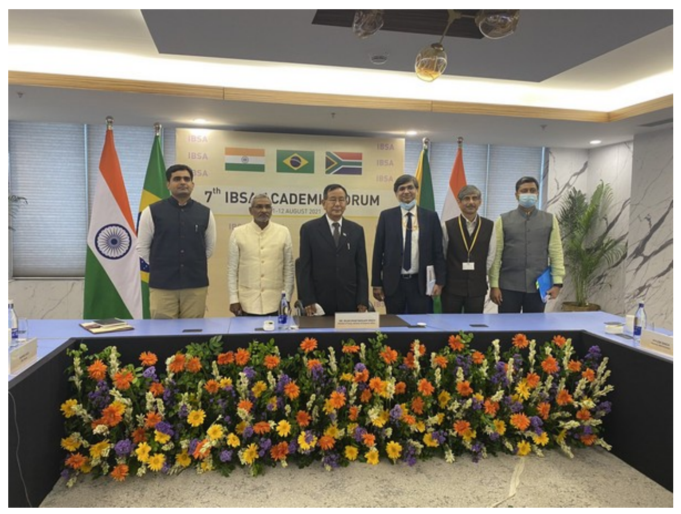
MOS inaugurates two-day 7th IBSA Academic Forum.