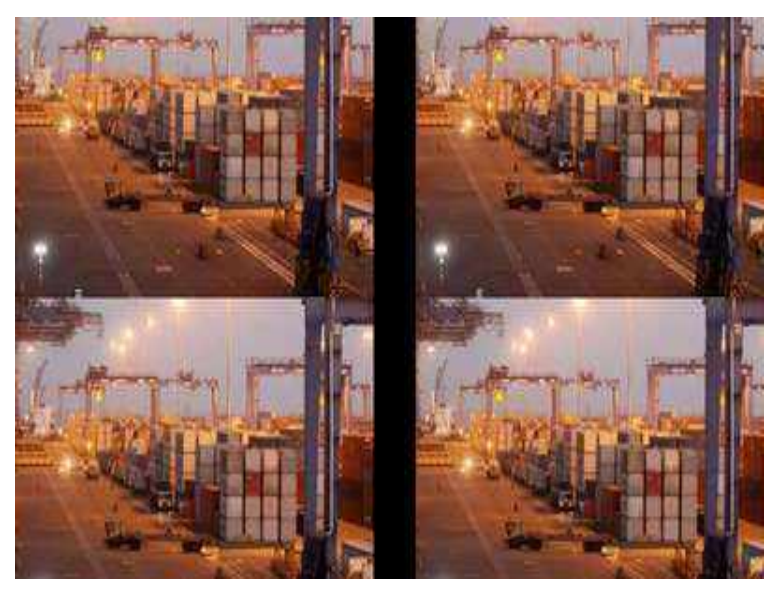
327 items form 3/4th of imports from China, 'can be alternatively sourced'

NEW DELHI: Just 327 products — ranging from mobile phones and telecom equipment to cameras, solar panels, air-conditioners and penicillin — accounted for nearly three-fourths of the imports from China, a study has estimated, while pointing out that it is possible to find alternative sources to get these goods or manufacture them in India.