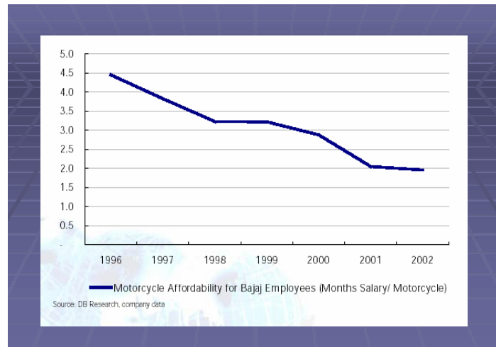
Figure 1a Affordability of Bajaj Employees, 1996-2002