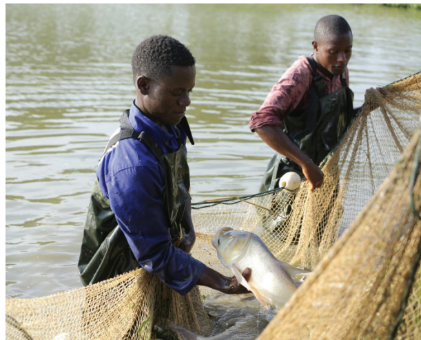
Developing aquaculture value chains is one of the main focus areas of Phase III of the project

Developed Country beneficiary nation for a SSC project to be implemented under the FAO-China SSC Programme. The first two phases – focused on crop and animal production – yielded dramatic results, including a quadrupling of rice production per hectare in the project areas, as well as increased milk production. This marked a break with years of low productivity, affecting the food security and livelihoods of more than 70 percent of Ugandans who depend on subsistence agriculture.