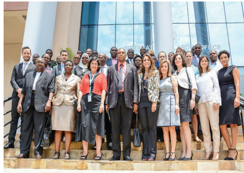
Dar es Salaam (ILO NEWS) - The International Labor Organization (ILO), Brazil and Tanzania organized a South-South Cooperation workshop to develop a project workplan on Decent work in the cotton sector in Tanzania from 14-18 November in Dar es Salaam.

ILO supports South-South Cooperation to promote decent work in the cotton sector in Tanzania. The ILO, Brazil and Tanzania teamed up to share experiences and best practices to enhance the national capacity to better respond to challenges in the cotton sector. South-South Cooperation initiative strengthens cooperation