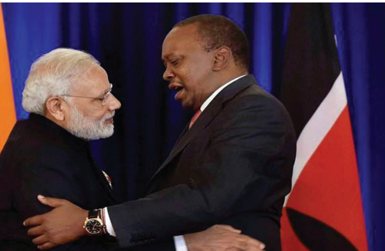
In response to Kenya's request to develop Kenya's film industry, India offered to consider deputation of Indian faculty to the School of Film Making in Nairobi.